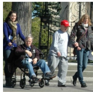
Walking to holy places in Canada >>> p. 5