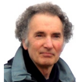
L'Arche in "new" countries >>> p. 3