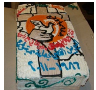
Hope in Iraq >>> p. 7